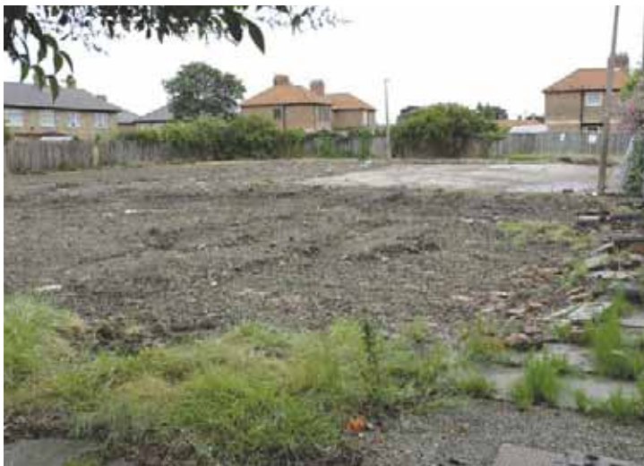
Former flats site - now a blank canvas for new development