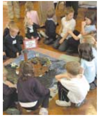
Above, Admiring the finished project