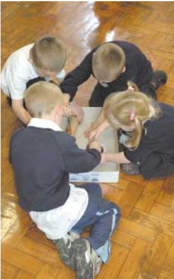
Above, Team work and concentration paid off for these artistic pupils