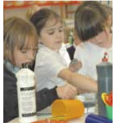
Below, Girl power - hard at work