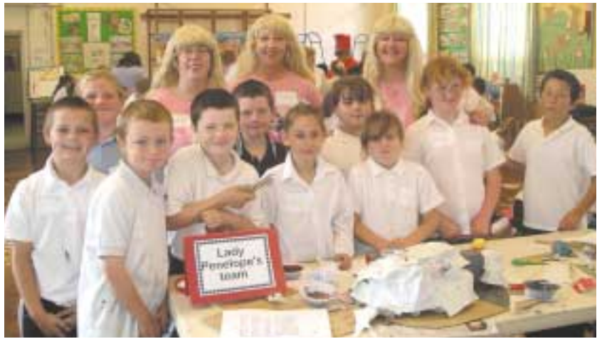
Above, Three Lady Penelopes from Enterprise 5 show their team how to go, go, go.