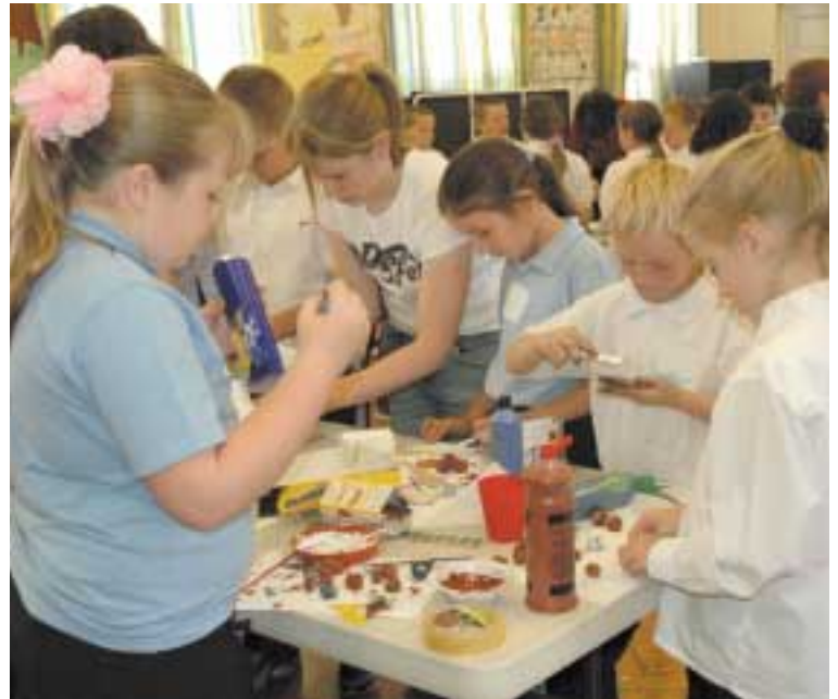
Below, Youngsters get stuck in determined to create the best Tracy Island